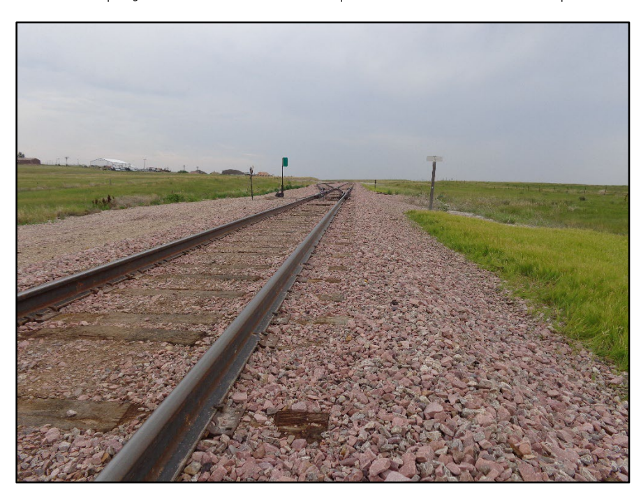
With a $978,200 CRISI grant, ASLRRA member Rapid City, Pierre & Eastern Railroad was able to make significant upgrades to its 100-year-old track. This photo from RCPE shows a section of the two-and-a-half mile project: a new turnout and some new 115-pound continuous welded rail.

Before the project, track conditions required eastbound trains to potentially slow to 10 miles per hour