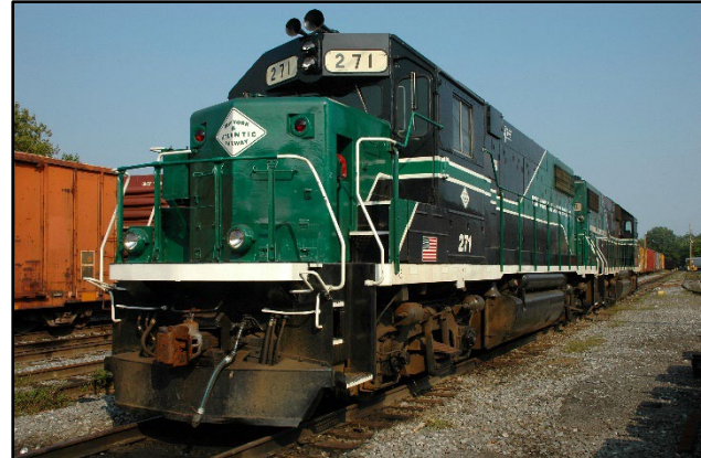
ASLRRRA members Chicago South Shore and South Bend Railroad (left) and New York and Atlantic Railway have both recently been featured in articles focused on their history and business achievements.