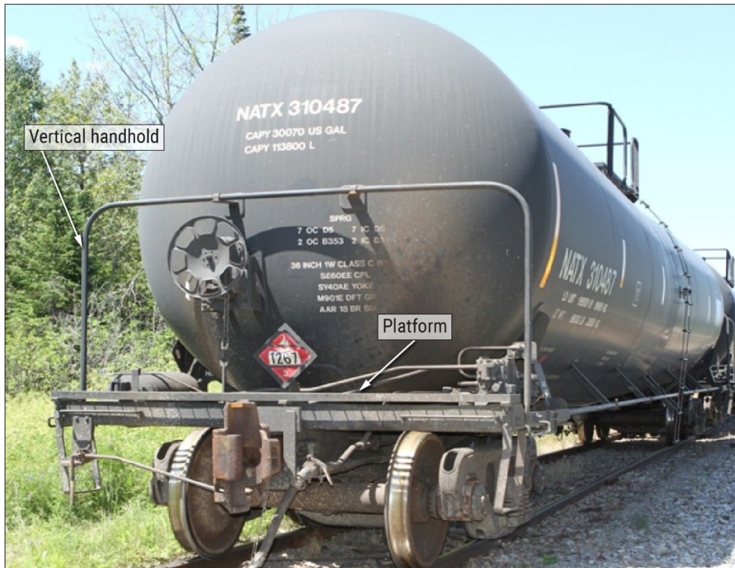
Figure 2. Exemplar tank car depicting the vertical handhold and platform.

the tank car as required by WDRL's Transportation Safety Rule T-17, Riding In or On Moving Equipment, with three points of contact (two feet on the platform and one hand on a vertical handhold). (See figure 2.) The accident conductor held onto the vertical handhold with his left hand, so that his body was partially turned away from the side of the highway-railroad grade crossing from which Federal Road traffic approaches. He was holding his lantern in the crook of his right elbow with his right hand on the radio microphone button to communicate with the locomotive engineer.