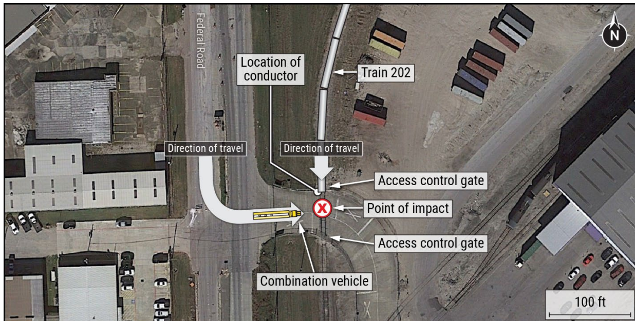
Figure 1. Overhead photograph of accident location.

The train crew consisted of one locomotive engineer, the accident conductor, and another conductor. The train consisted of 2 locomotives and 25 tank cars. Fifteen of the 25 tank cars were hauling gasoline, and the remaining 10 tank cars were hauling diesel fuel. The combination vehicle was placarded to carry hazardous materials and was carrying fuel residue at the time.