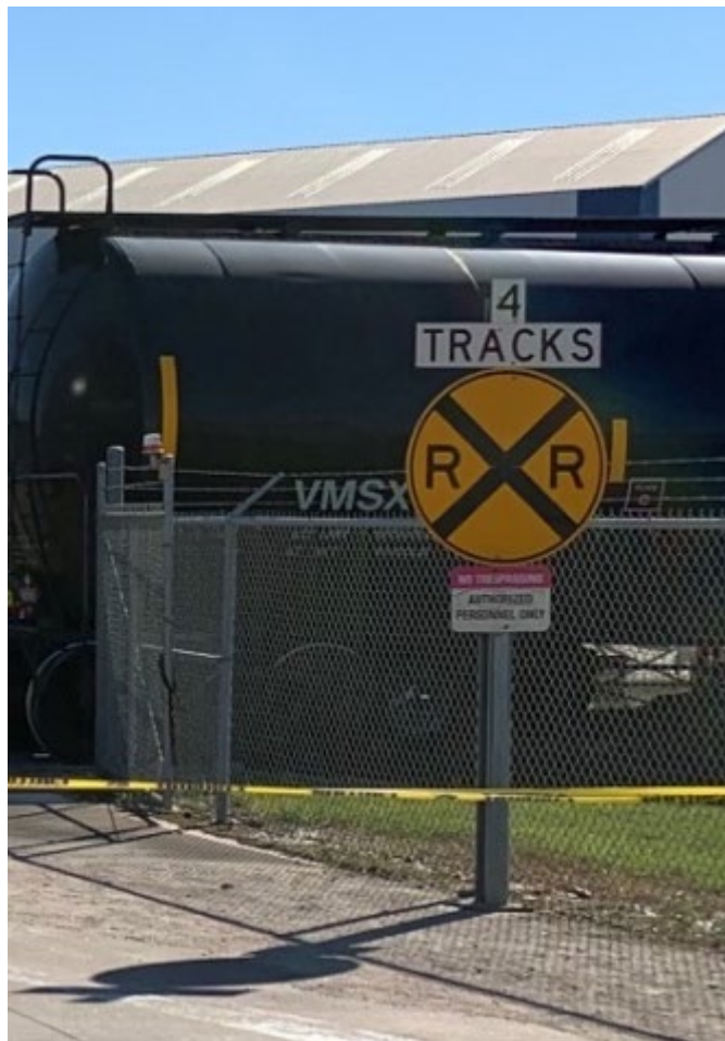
Figure 3. Highway-railroad grade crossing at Greens Port Industrial Park

The grade crossing was equipped with passive warning devices including pavement markings and an advance warning sign facing Federal Road. (See figure 3.) The grade crossing was not equipped with active warning devices (such as lights that flash only when a train is approaching or occupying a crossing) or crossing gates, nor was an employee stationed at the crossing to protect it.